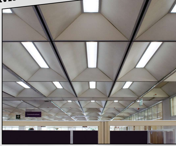
Original Fluorescent Lighting